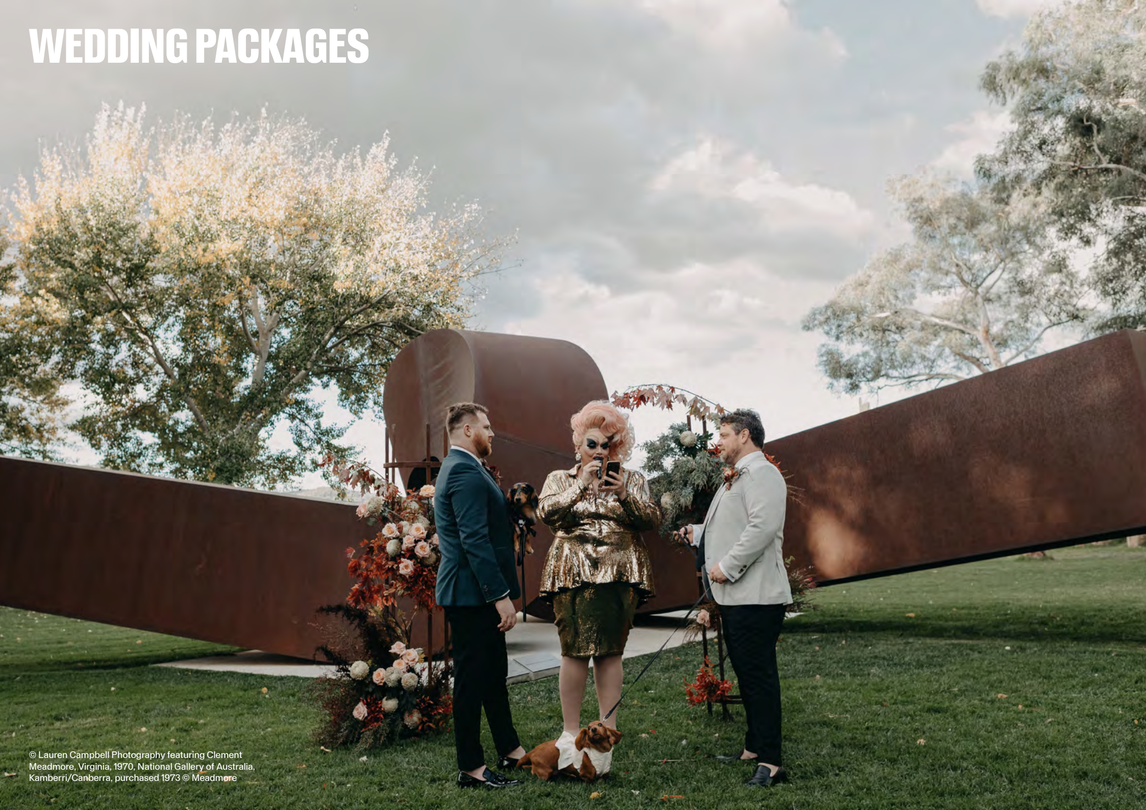
© Lauren Campbell Photography featuring Clement Meadmore, Virginia, 1970, National Gallery of Australia, Kamberri/Canberra, purchased 1973 © Meadmore